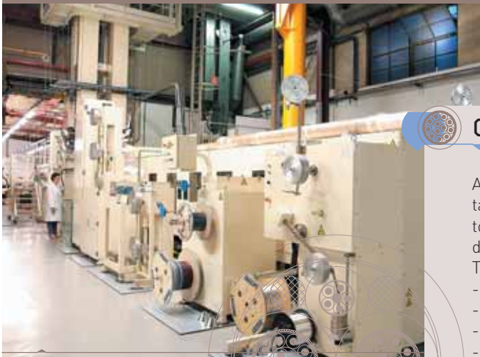
PTFE EXTRUSION MACHINE DEVELOPED BY AXON'

Factories in various world wide locations for better service to local markets. Manufacturing capability for small, medium and large volume applications.