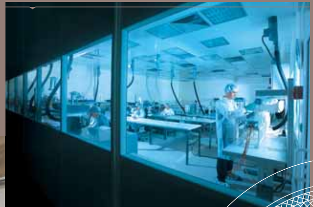
AXON' CLEAN ROOM

Our manufacturing team managed by skilled engineers who are experienced in the demands of high-tech markets.