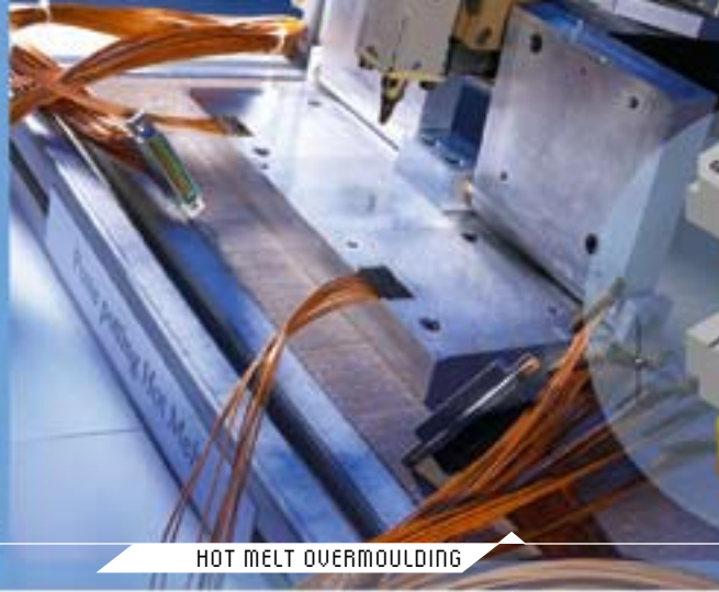
HOT MELT OVERMOULDING