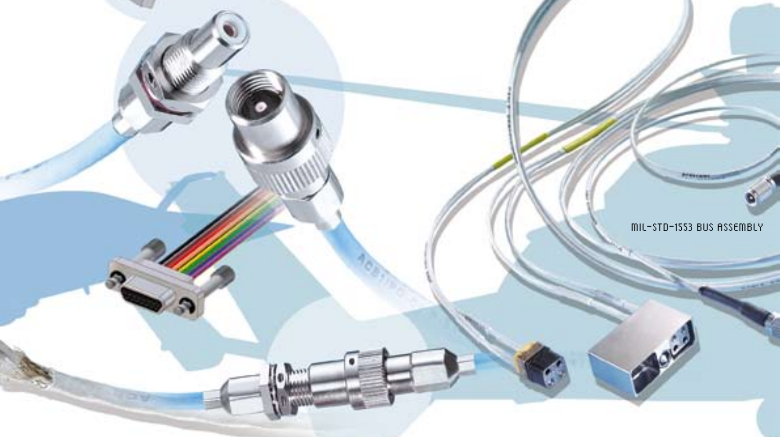
MIL-STD-1553 BUS ASSEMBLY

➤ Plastic and metal NANO-D connectors for extreme miniaturisation Nano-D backshells, custom designed Nano-D shells. Characteristics : twist-pin contact (1 Amp) Standard : MIL-DTL- 32139