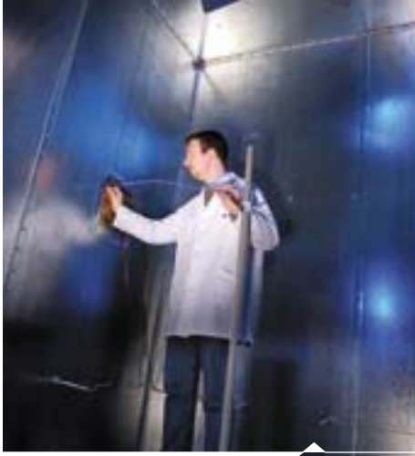
MODE STIRRED CHAMBER